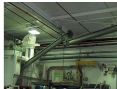
Incline conveyor feeding cross conveyor