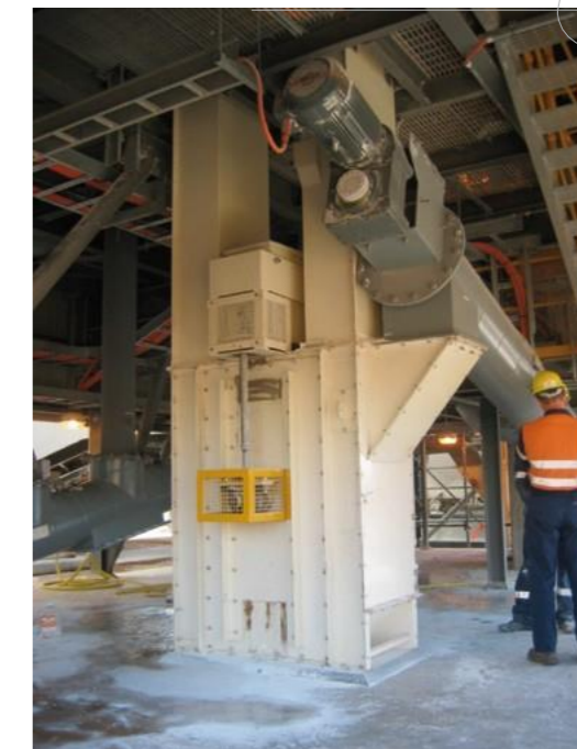
Screw Conveyor feeding a Bucket Elevator

All IBS Screw Conveyors can be fitted with heating and cooling jackets utilizing steam, thermal liquids, refrigerant, water or brine. Heating or cooling can be designed by our process engineers who will recommend the most suitable size and type of conveyor for your production and needs.