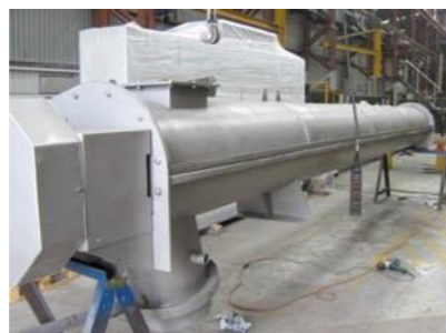
Tubular Screw Conveyor

Efficiency of vertical conveyors can be as little as 10% and generally require specific design considerations; specifically the nature of material and feed method. IBS engineers can assist with the best and most suited conveyor for your needs.